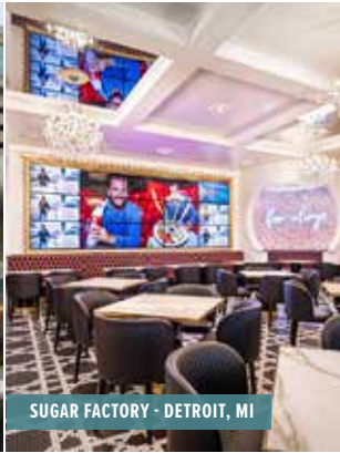
SUGAR FACTORY - DETROIT, MI