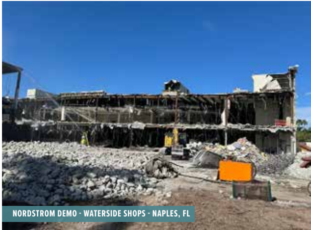
NORDSTROM DEMO - WATERSIDE SHOPS - NAPLES, FL