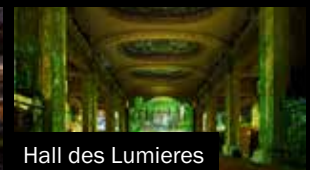
Hall des Lumieres