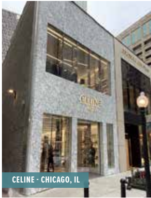
CELINE - CHICAGO, IL