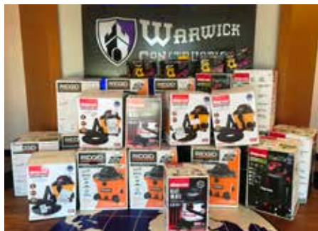
Just ONE day of deliveries to the Warwick offices.