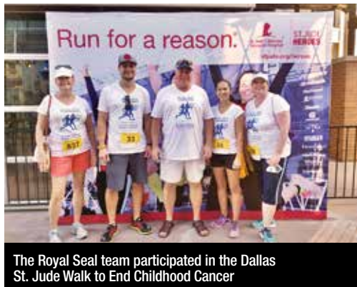
The Royal Seal team participated in the Dallas St. Jude Walk to End Childhood Cancer

Young Life is a special mission to Royal Seal; the future of our country is the youth of today. With so many unhealthy choices that children and grandchildren have today, Young Life offers a positive alternative. This