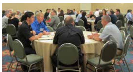
RCA members and leaders at the roundtables

RCA committee leaders. The topics included RCA's Education, Scholarship, Marketing & Communications, Membership, Sponsorship, and Safety efforts. The roundtables were a combination of imparting information about RCA's committees, responding to questions, and getting feedback and ideas for future initiatives and efforts.