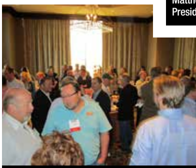
Friday's Welcome Reception